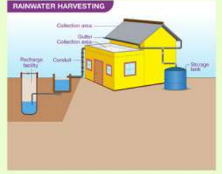
AUTOMATIC WATER LEVEL CONTROLLER