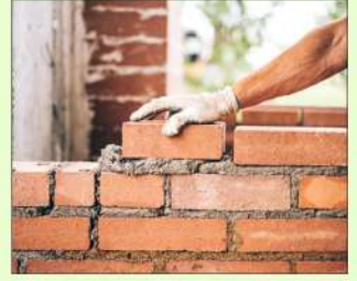
RED BRICKS CONSTRUCTION