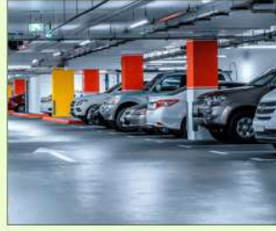
COVERED CAR PARKING